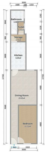
Milner Road Ground Floor