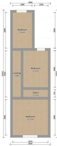
Milner Road First Floor